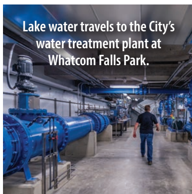
Lake water travels to the City's water treatment plant at Whatcom Falls Park.