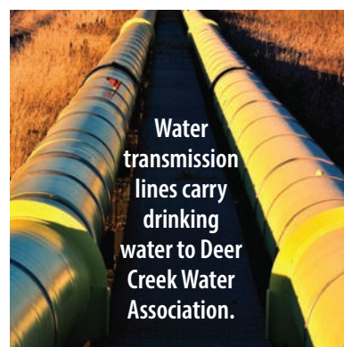
Water transmission lines carry drinking water to Deer Creek Water Association.