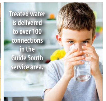
Treated water is delivered to over 100 connections in the Guide South service area.