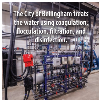
The City of Bellingham treats the water using coagulation, flocculation, filtration, and disinfection.